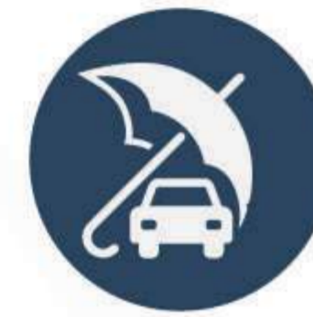
Motor Third Party Liability

ACIG E-service enables customers to issue insurance policies for various insurance products and lines under Individuals schemes and corporates daily over hour 24\7 through the following link: