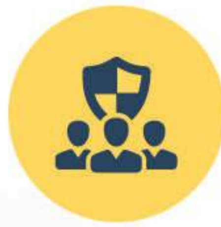
SMEs Medical Insurance