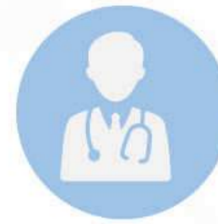
Medical Malpractice Insurance